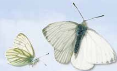
Green-veined White 50mm

The Holly Blue is the only blue butterfly found in our gardens; the caterpillar feeds on Holly and Ivy.