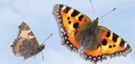
Small Tortoiseshell 50-56mm

Only the male Orange Tip has orange tips. The female is white all over, but both have green camouflage underneath.