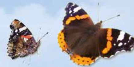
Red Admiral 67-72mm

Because the Meadow Brown caterpillar feeds on many different grasses, this species can be found in many places.