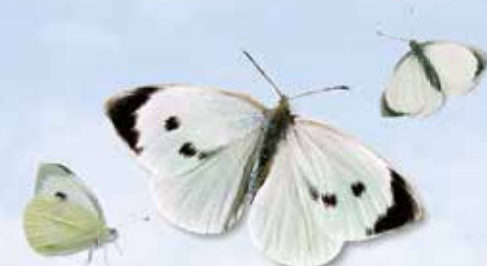
Large White 63-70mm

The Painted Lady arrives here every year after flying all the way from Europe.