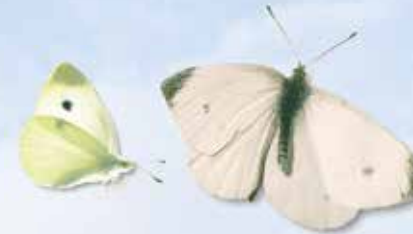
Small White 48mm

The Red Admiral used to migrate from Africa but now lives here due to climate change.