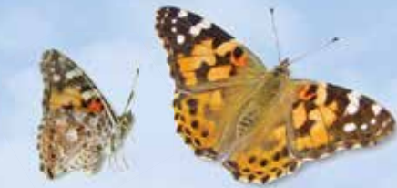
Painted Lady 64-70mm

The Peacock flashes the eye-spots on its wings to stop birds trying to eat it!