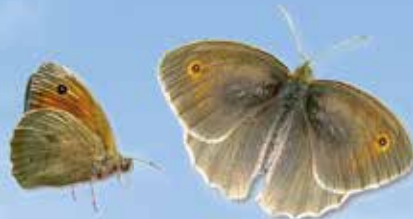
Meadow Brown 50-55mm

The Comma's name comes from the comma shaped marking on the underside of its wing.