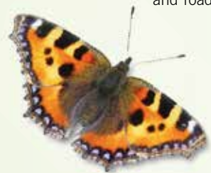
Left: Small Tortoiseshell

Your garden, or even a window box, can provide a lifeline for butterflies struggling to find food and shelter.