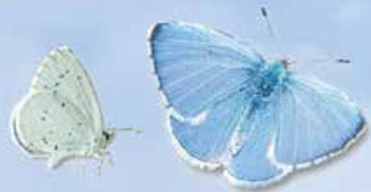
Holly Blue 35mm

This guide only covers the most commonly occurring garden butterflies. If you see any other species or would like to know more about how to encourage butterflies, please visit www.butterfly-conservation.org