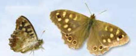
Speckled Wood 47-50mm

Blue spots on wing edges are a key difference between Small Tortoiseshell and Painted Lady.