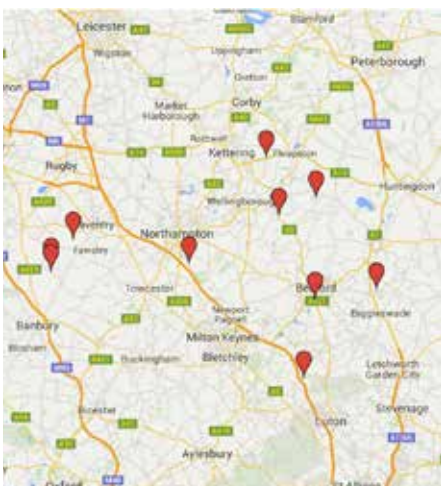
WCBS Beds and Northants 2011