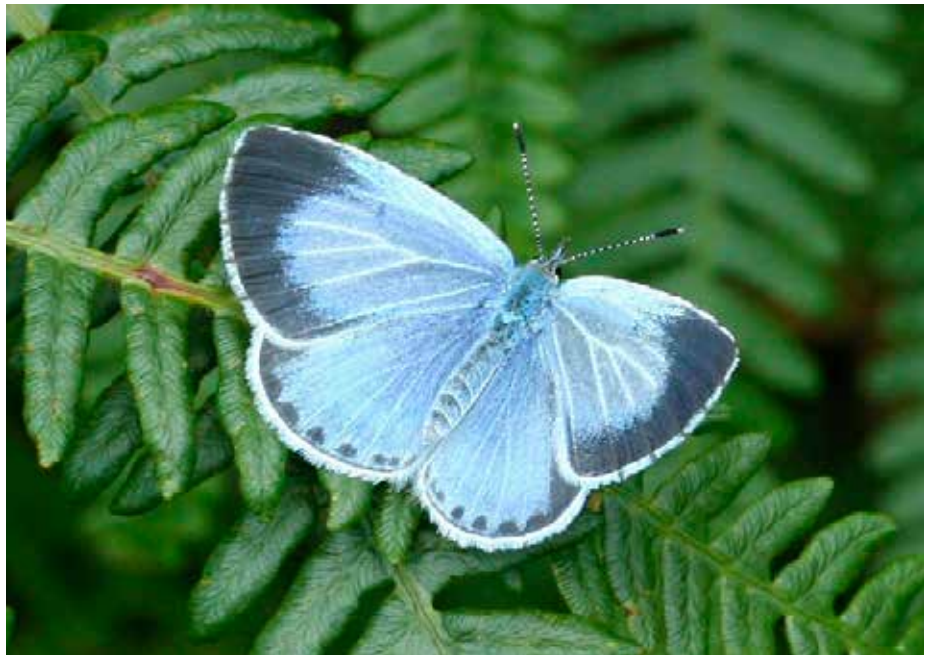
Holly Blue was up by 16 percentage points in 2015, with the majority being seen during the first three weeks in August

Silver-washed Fritillary, which is by far and away the most frequently seen habitat specialist species on WCBS surveys, experienced its best year in