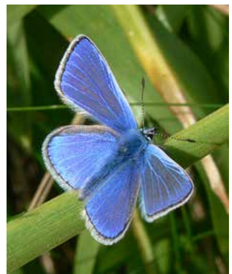
Common Blue - Tim Melling

25 species of butterfly were seen in Beds and Northants in 2015. Large and Small White were the most widespread. Two blues had a good year in this area in 2015 in terms of occupancy. Holly Blue up by 38 percentage points and Common Blue up by 21 percentage points compared to 2014 levels.