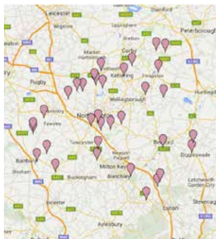
WCBS Beds and Northants 2015