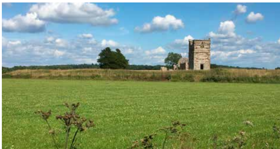
The ruins of Knowlton Church sit roughly in the middle of this picturesque square in deepest Dorset - John Parr

Meadow Brown. The weather in August was terrible and at one point it seemed that we may not get a suitable day before the month ended, but finally the weather improved and we managed a visit on the 22nd. The temperature was 27 degrees with clear blue skies! Numbers of butterflies for the August visit were up on 2014 with 34 individuals of 8 species seen compared to only 10 individuals of 2 species. The records were entered online through the simple interface provided by the scheme and that was it for 2015. After a year or two you begin to feel an 'ownership' for the square. It is interesting to watch the variation in species seen and numbers across the various sections of the route – an area which was full of wild flowers and butterflies in July had no flowers and no butterflies in August. An area devoid of nectar sources on one survey had thistles in flower on another, attracting species such as Small Tortoiseshell. The best year for butterflies in this square was 2013 when we saw 253 butterflies of 12 species. The worst year was 2014 when we only saw 89 individuals of 8 species. We look forward to surveying 'our square' in future years to continue to see how the butterflies fare!