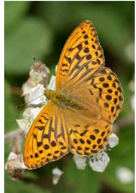
Silver-washed Fritillary, the most frequently seen habitat specialist species, experienced its best year in the WCBS being located in 9% of squares

Wall Brown was worryingly scarce again, down six percentage points on 2014 levels and being seen in only 4% of squares – less than in any other year in the series. The greatest loss was in Wales where occupancy was down from 34% in 2014 to 6% in 2015. In England this butterfly was seen in 5% fewer squares in 2015 compared to 2014. Speckled Wood and Small White were also much scarcer than in recent years.